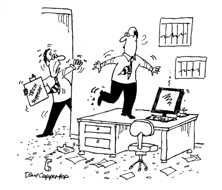
"Hold it! That's not what they mean by 'reboot'."

Quick And Easy Ways To Improve Your Mental Health You face a lot of different stressors as a business owner. You have to worry about the well-being of your business and team, find ways to stay relevant and profitable and, of course, make time for your family and friends. Dealing with all this stress after a few weeks or months is enough to put you at your wit's end, but how can you maintain your mental health while attempting to grow and run a successful business?